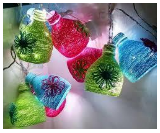
LIGHT BULB HOLDER